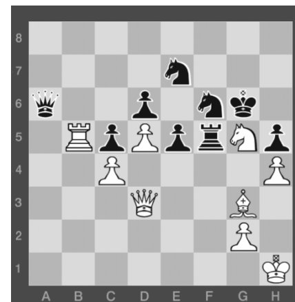
Black to play and win.