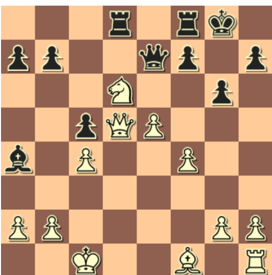
Diagram 3: Black to play