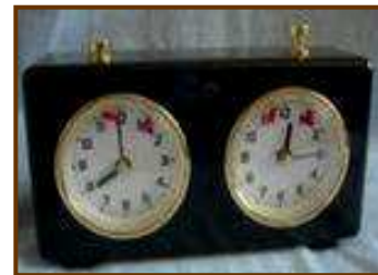
Analogue clock $45.00