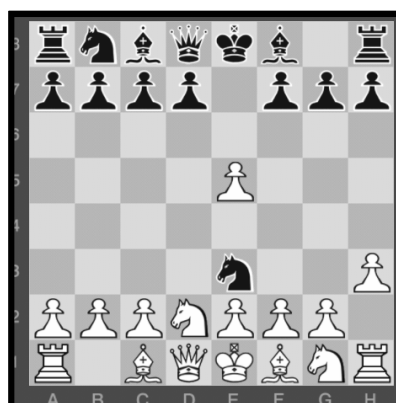
White to play and lose!!